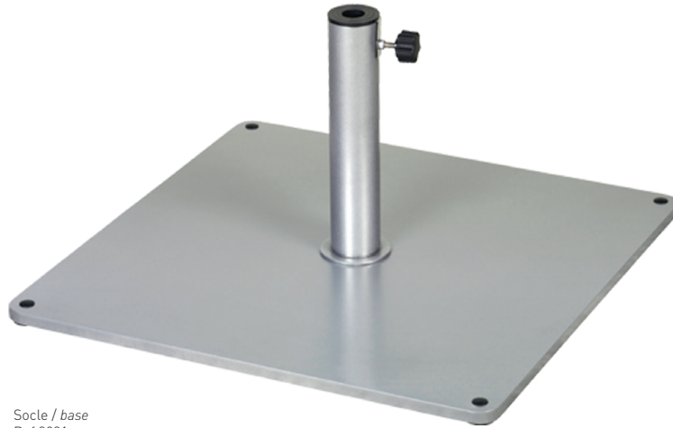
Socle / base Ref 3031